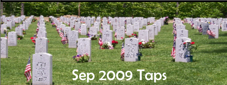
Sep 2009 Taps

NONPROFIT ORG AUTO US POSTAGE PAID DOVER, NH PERMIT 615