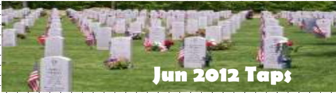
Jun 2012 Tap